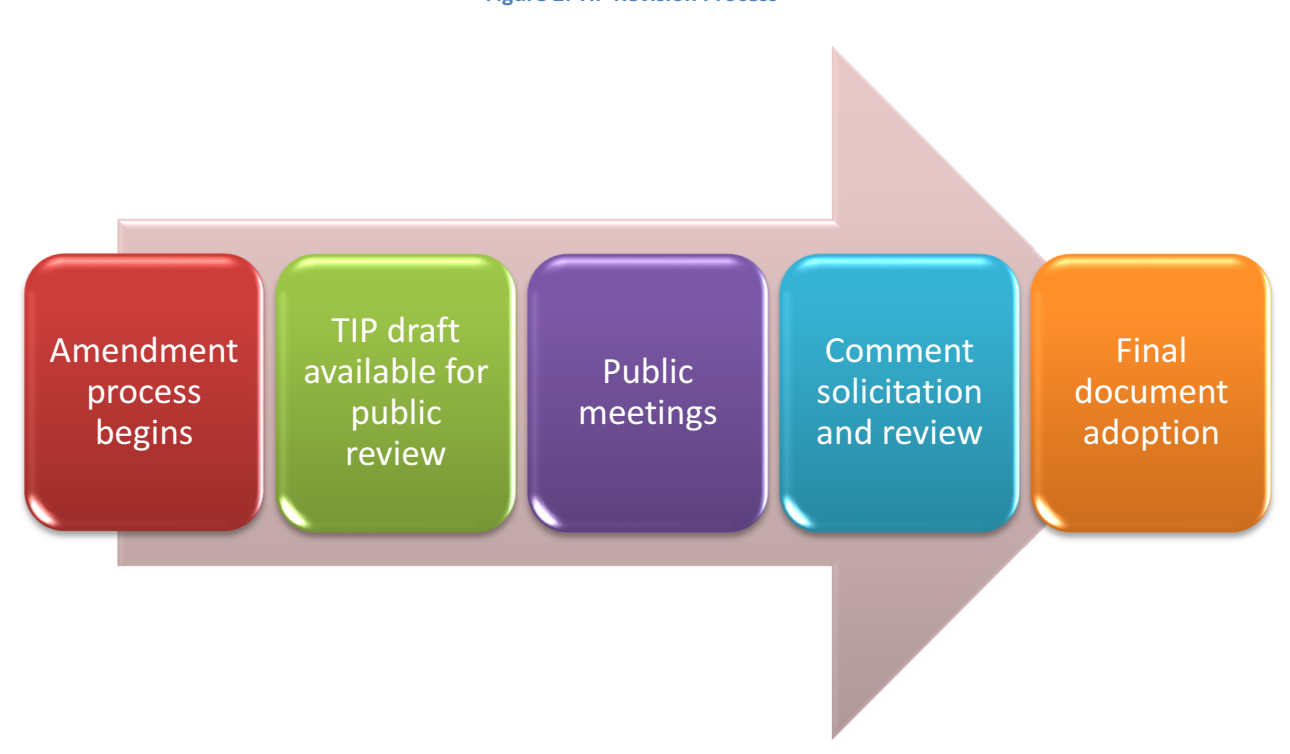
Figure 2: TIP Revision Process